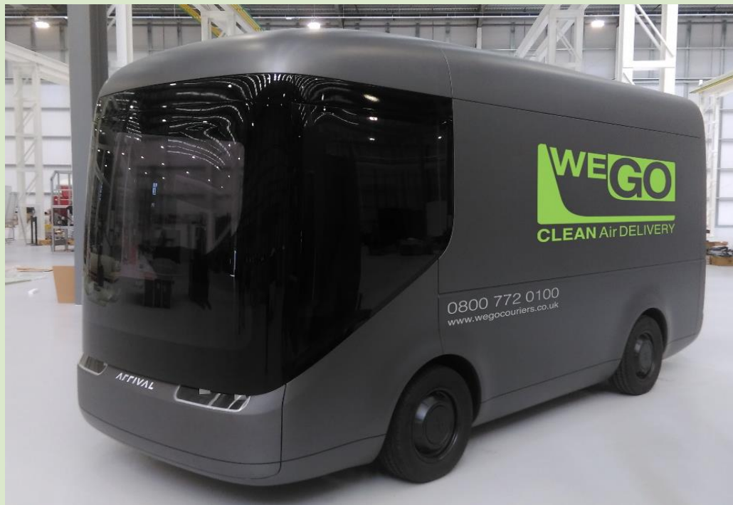
Chris Beattie: Transforming 'Last Mile Logistics' with zero emission vehicles