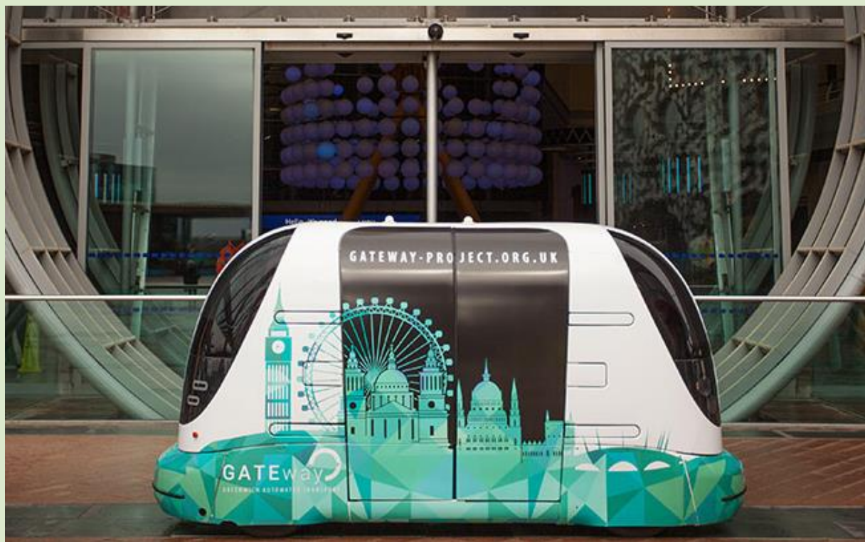
Chris Beattie: Transforming 'Last Mile Logistics' with zero emission vehicles