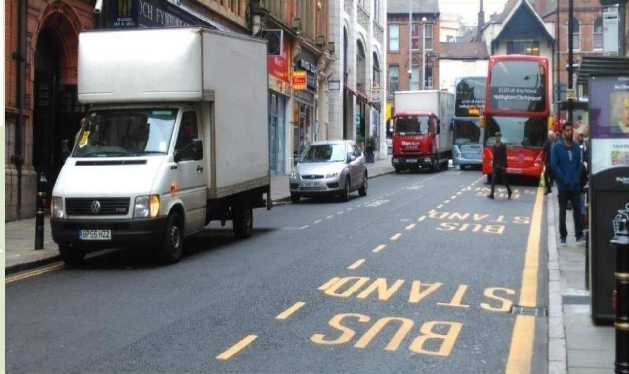
Chris Beattie: Transforming 'Last Mile Logistics' with zero emission vehicles