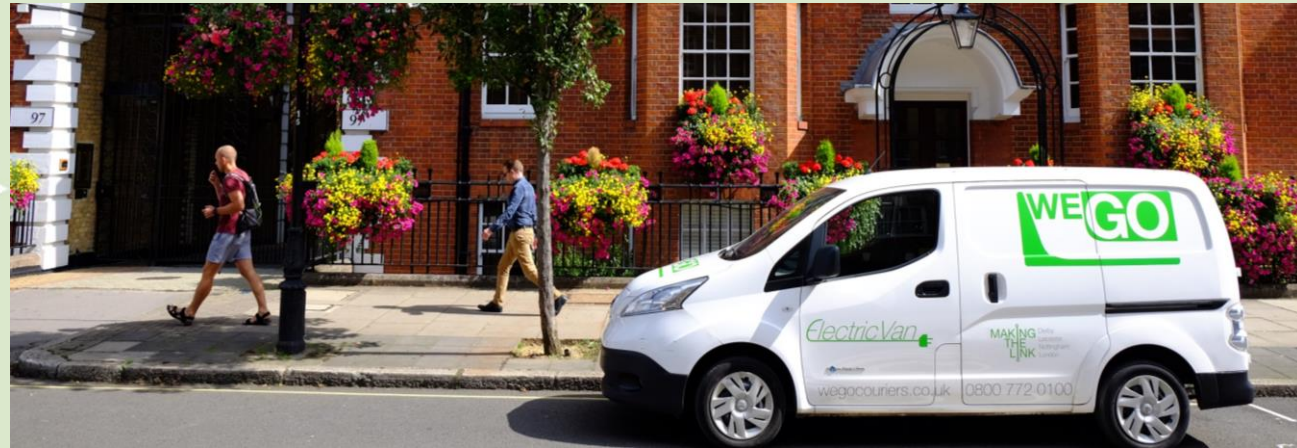
Chris Beattie: Transforming 'Last Mile Logistics' with zero emission vehicles